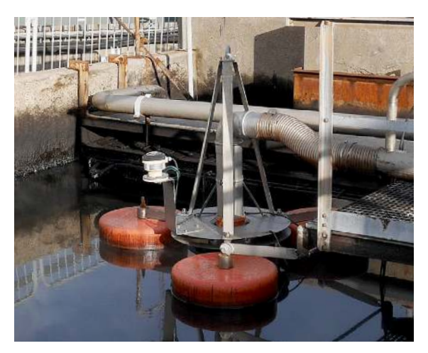
An Ultra-SurfCleaner operating in an API separator.

Ultra-SurfCleaner's patented collection and separation process has been developed into a self-managing solution consisting of only two moving parts. The separated oil is discharged to an external storage tank. Disposal costs are minimized since the oil is up to 100% pure and recyclable.